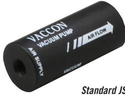
Standard JS-40UM without silencer.