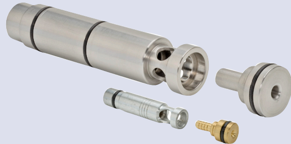
Top: Custom made C350H-303 stainless steel venturi cartridge 5.375" L x 1" dia. Bottom: Standard Mid Series C150H aluminum/brass cartridge is 2.2" L x 0.40" dia. Both cartridges generate up to 28"Hg.