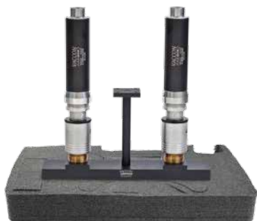
CDF 500H and Custom Plenum Pick & Place of laser cut foam