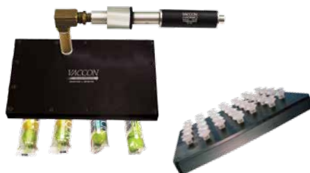
VDF 750, Custom Plenum Pick & Place of gum ball packs